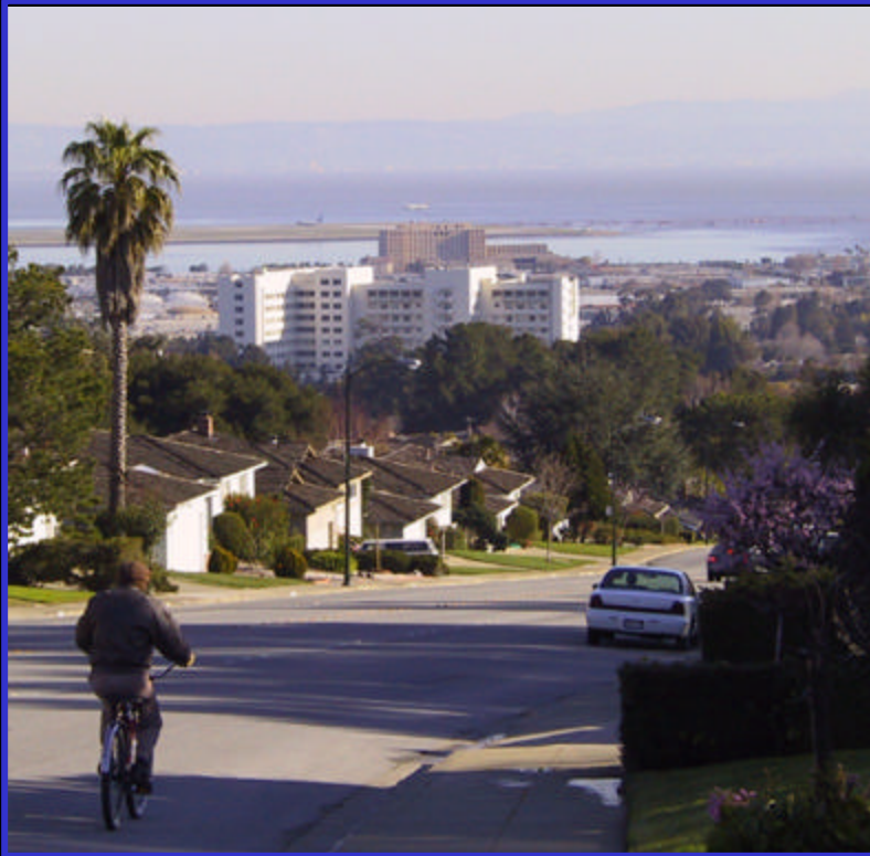
Peninsula Medical Center

Evaluation of Potential Uses for remaining District Land adjacent to the new replacement hospital