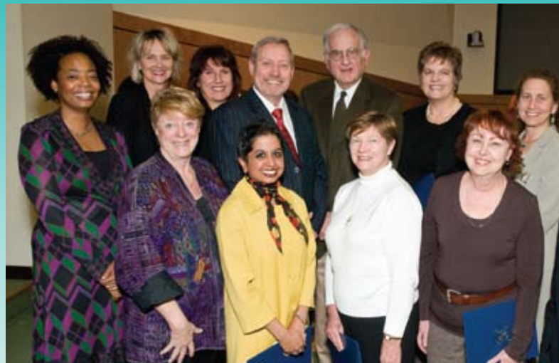
Representatives from organizations receiving 2010 grants.