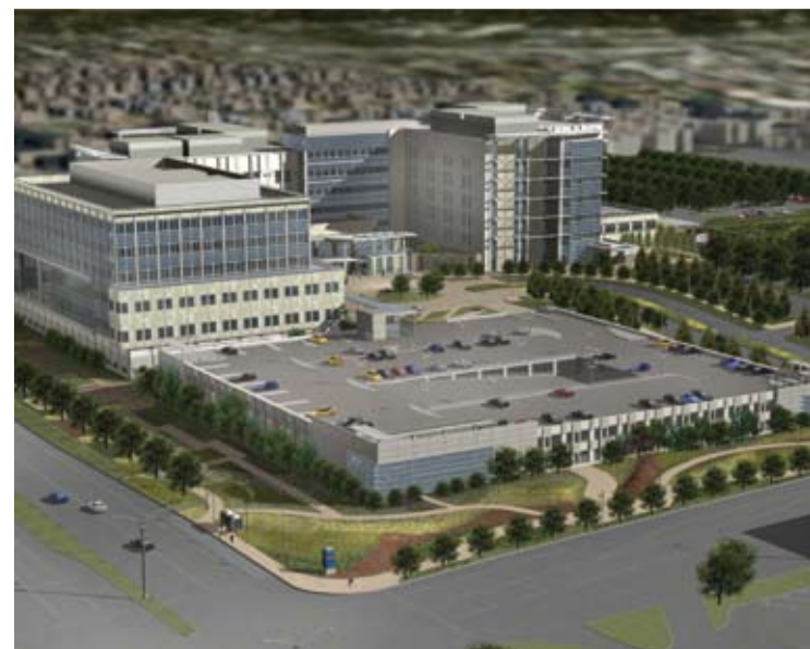
Artist's renderings show the southern view (below) of the new Mills-Peninsula Medical Center and an evening view (below left) of the hospital's entrance.