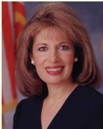
Congresswoman Jackie Speier

Cord blood cells have been transplanted in more than 14,000 adults and children over the past two decades to treat more than 70 diseases.