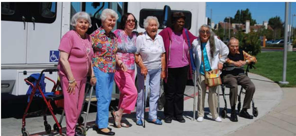
Seniors on the move: District residents take part in the PJCC's Get Up and Go transportation program.

Additionally, the District has advanced several studies to assess future needs, including dental care access for frail elderly and special needs adults, assisted living, memory care, and long-term acute care. Reports and recommendations on the outcomes of these studies will be presented at Board meetings throughout the year and summarized on the District's website, www.peninsulahealthcaredistrict.org .