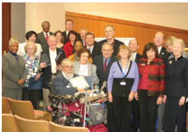
The District's 2011 Community Health Champions, Grant Recipients and Community Volunteers at the January 27 event.