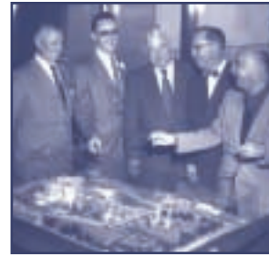
Key supporters looking over plans for proposed Peninsula Hospital, 1954

With Senate Bill 1953, the State of California established stricter seismic safety standards for general acute care hospitals, which must be met by 2013 or a termination of operations is required. Mills-Peninsula and the District did two independent studies, both concluding that the only feasible approach to comply with SB 1953 would be to re-build the hospital. Although a retrofit was possible, the cost was significant and there was no guarantee that the hospital could remain open during retrofitting. Because a new hospital is required, Mills-Peninsula Health Services is renegotiating all terms and conditions of the established 1985 lease with the Peninsula Health Care District. Under the current contract, the District does not have the authority to make operational or policy decisions.