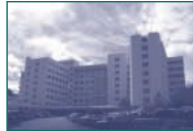
Current Peninsula Medical Center

Note: The Peninsula Health Care District has no oversight or responsibility for the Mills Health Center located in San Mateo. Mills Health Center is wholly owned and operated by Mills-Peninsula Health Services, an affiliate of Sutter Health, and is outside the authority of the Peninsula Health Care District.