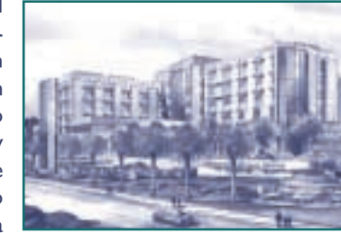
Rendering provided by Mills-Peninsula Health Services

The present proposal includes an approximate $400 million investment from Mills-Peninsula to build a seismically safe, general acute care hospital to replace Peninsula Medical Center using its current 26-acre site.